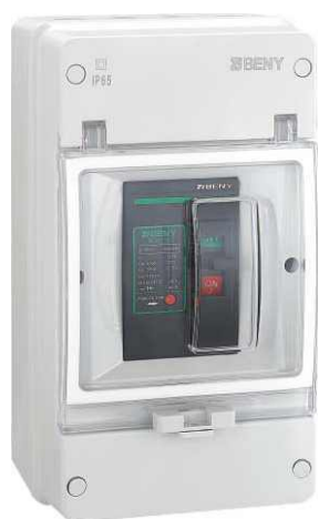
BDM-125 with IP65 Enclosure